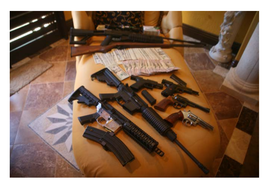
Cash and weapons found by OIG agents while executing search warrant